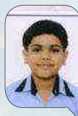
Kapila Chawla 2D