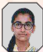
DRISHTI Eng 96, PEdu 94