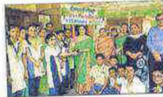
Children took out a rally