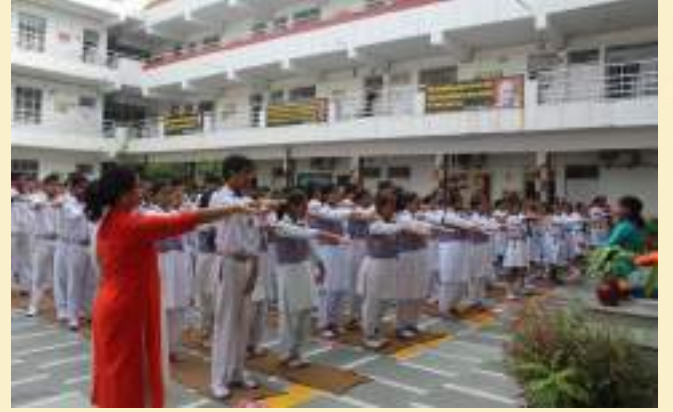
Oath Ceremony- Sabka yahi naara Swatch Bharat ho hmara.