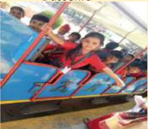
Visit To Rail Museum