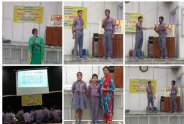
Sanskrit Saptah-संस्कृत दिवस एक परम्परा है।