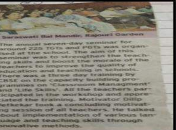
Saraswati Bal Mandir, Rajouri Garden