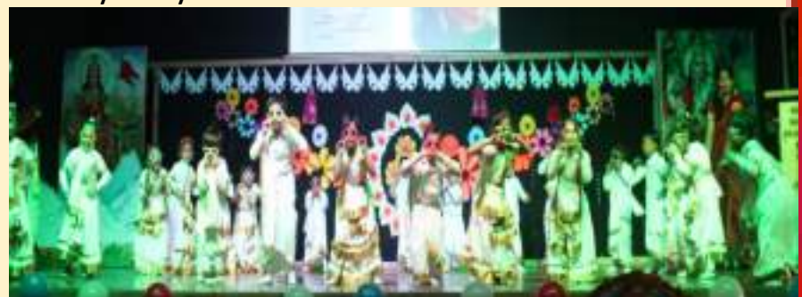
Annual Day Celebration

Shishu Vatika -Fun and learning go hand in hand - the school follows the tradition of strengthening the root of its pupils by inculcating the values in them.