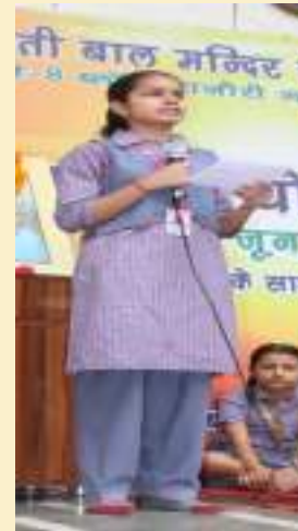
Ashtadashi Shalok Geeta - श्रीमद् भगवद् गीता के श्लोक में मनुष्य जीवन की हर समस्या का हल छिपा है।