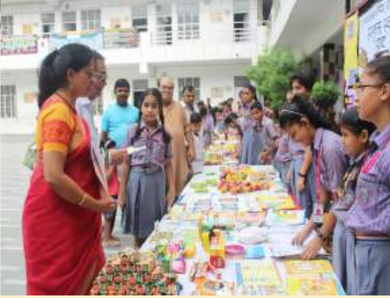
Swadeshi Haat- Dil se desi -“SWADESHI”

Gau Jaap -गाय एक ऐसा प्राणी है, जिसमें भगवान का वास माना गया है।