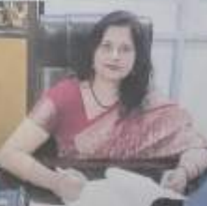
From left, Principal, Saraswati Bal Mandir, Rajouri Garden

Q What emphasis do you put on teacher training? A Teaching is the most dynamic, challenging profession. Teachers are in charge of human future of civilisation for perfection is mandated for continuous professional development and capacity building. Teachers should remain updated. Students should look up to highly trained. There is a shift in the wave were trained then and in vice training can empower to execute a rich and