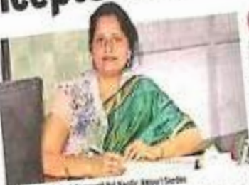
From left, Principal, Saraswati Bal Mandir, Rajouri Garden

Q How does the student view of the technology of the school, both in terms of the quality of the education and the challenges they face in the classroom? A The student view of technology in the classroom is very positive. They are very keen to learn about the latest technology. They are also very keen to learn about the latest technology. They are also very keen to learn about the latest technology.