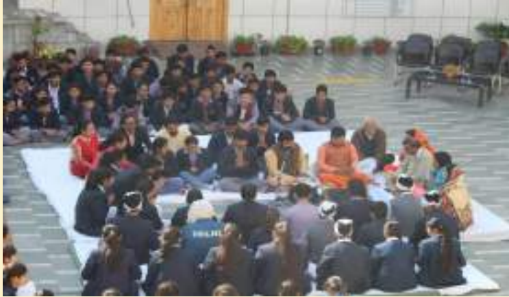
Hawan-हिंदू धर्म में शुद्धीकरण का एक कर्मकांड है।