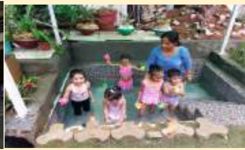
Aqua Day Celebration