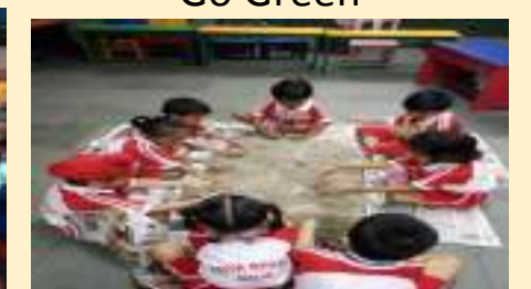
Play Way Method