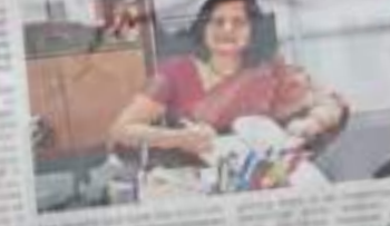
From left, Principal, Saraswati Bal Mandir, Rajouri Garden

Q The education system is often criticized for being too rigid and not allowing for individual differences. How can we make it more flexible and inclusive? A The education system is often criticized for being too rigid and not allowing for individual differences. How can we make it more flexible and inclusive?