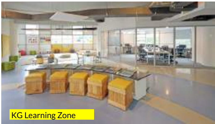
KG Learning Zone