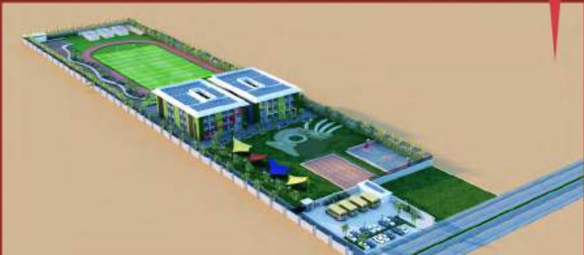
Vega School - Sector 76, Gurugram, 122001 (Near Emaar Palm Heights)

For Admissions Email: admissions@vega.edu.in Call: (+91) 99997-11334