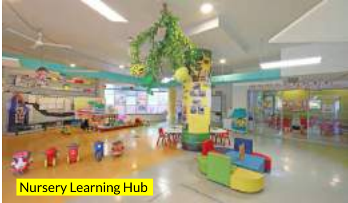
Nursery Learning Hub