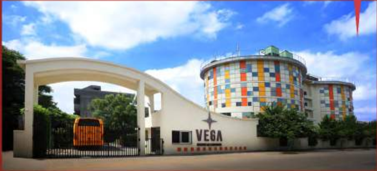
Vega School - Sector 48, Gurugram, 122018 (Near Eldeco Mansions, Sohna Road)