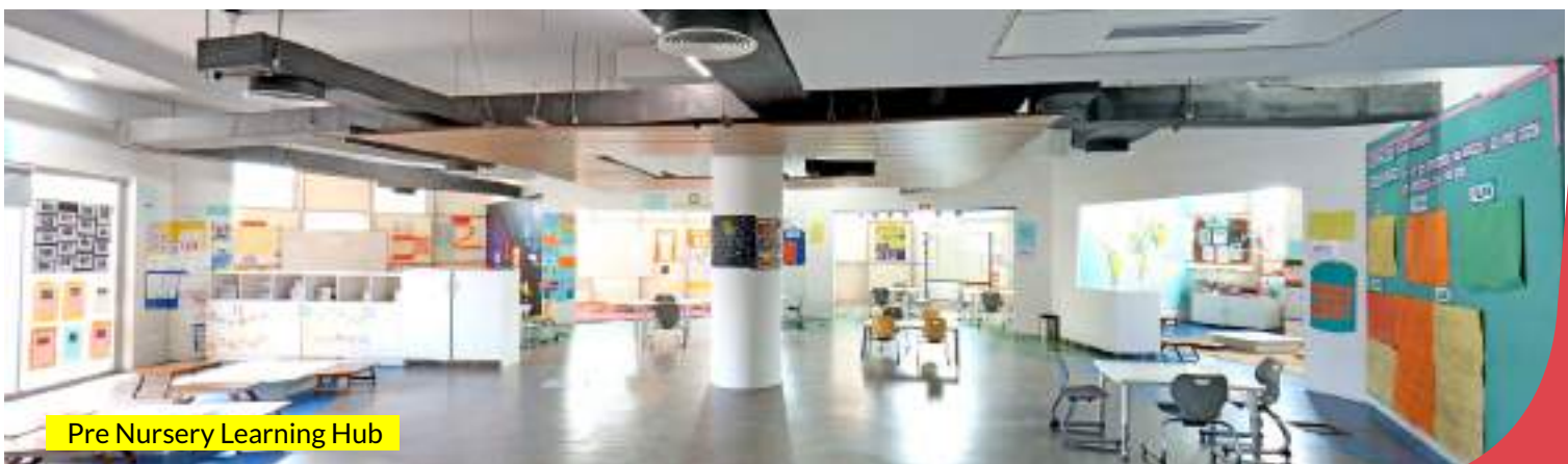
Pre Nursery Learning Hub