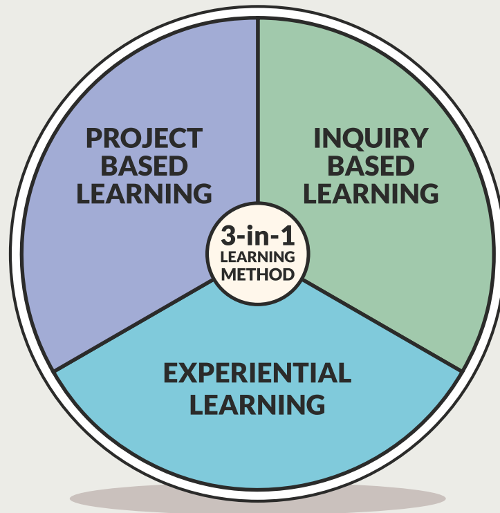
Problem-Based Learning : The 3-in-1 Learning Method

Every child is unique and has his or her individual strengths. It would be a waste of their innate talents to teach them by methods that are universal in their applicability and not mindful of their individual abilities. We nurture the potential of every child and help them discover their unique abilities through our learning pedagogy of Problem-Based Learning (PBL).