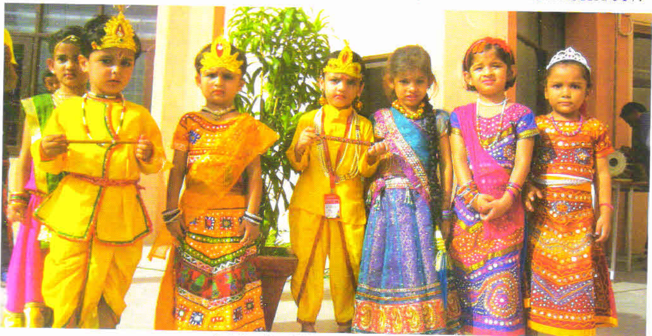
Celebrating Krishna Janamashtami

The School is affiliated up to Senior Secondary level to the Council for the Indian School Certificate Examinations, New Delhi (an All India Board). Our affiliation No. is HR/017.