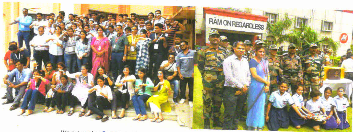
Workshop by Google India