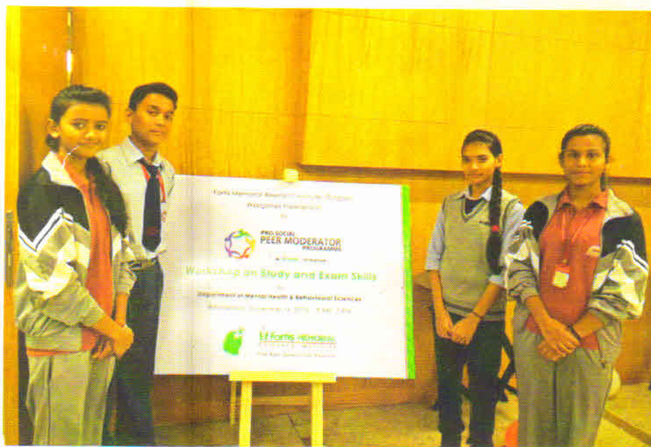
Workshop for Peer Moderators, Fortis Hospital