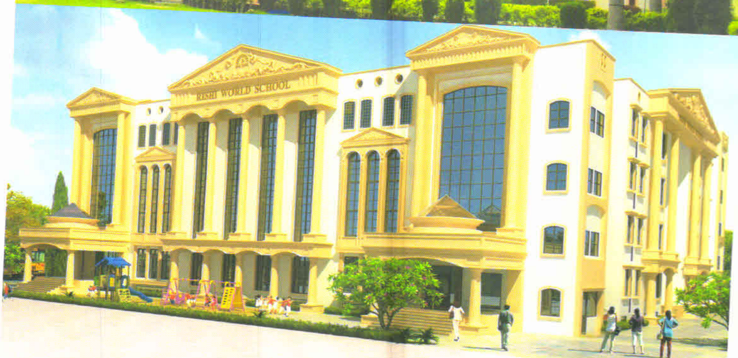
Rishi World School, Dhuruhera