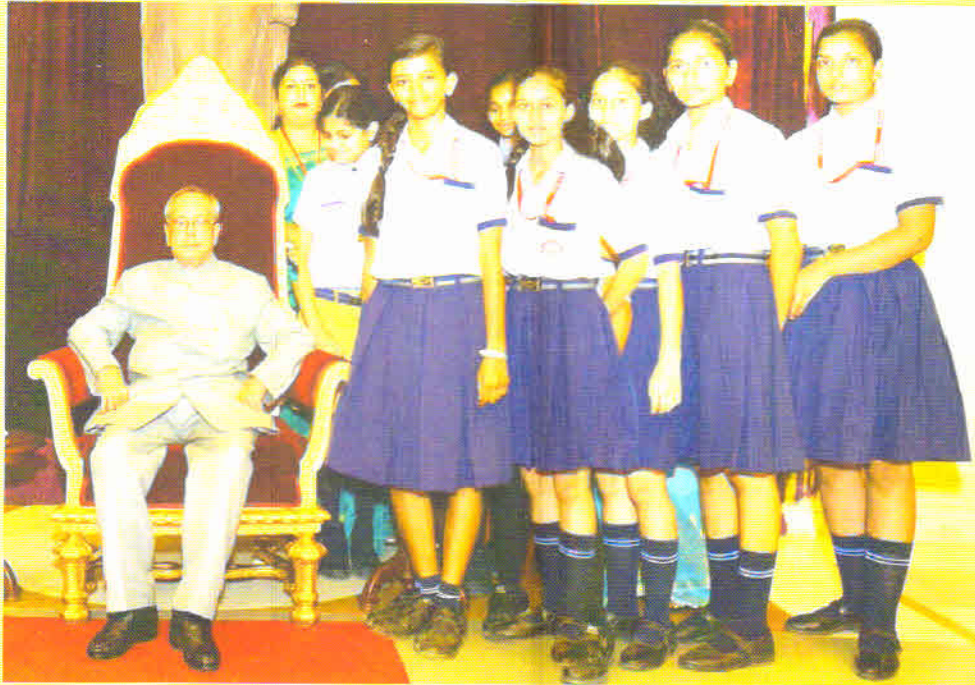
Our Students with the President Of India

Global Perspective: Where students are exposed to interaction with activists from around the world