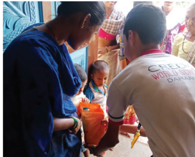
Donate Old clothes drive