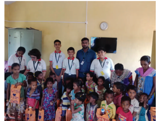
Charity Drive organized to buy gifts for Zila Parishad School