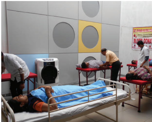
Blood Donation Drive