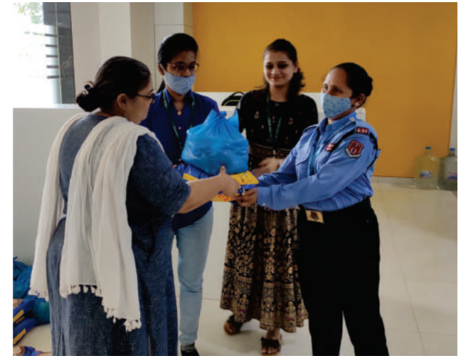
Sewa Week – Food Donation Drive