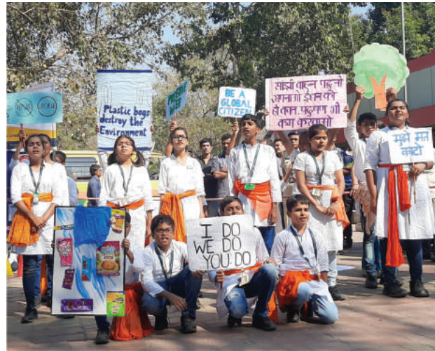
Nukkad Natak on Social Messages