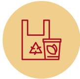
Environmental Science Kit