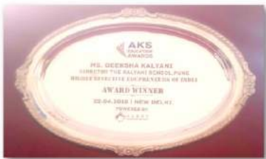
Director, TKS – Edupreneur of the year Award, 2017-18