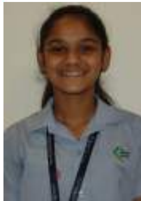
Dia Rao VII-A Won 2 National Awards in Karate