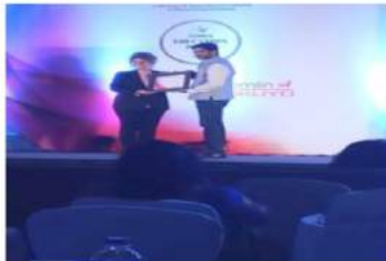
Times Education Icon Award for "Top Most Emerging schools" of Pune, 2018