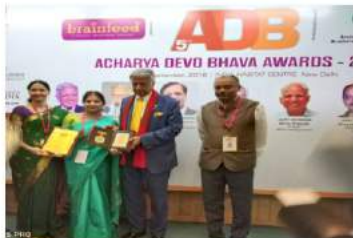
Acharya Devo Bhav Certificate, 2018