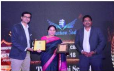
Ranked 1st in Pune & 6th in Maharashtra under Day – Boarding Co-ed school category, 2017-18

"A little progress each day adds up to big results."