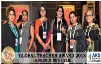
Global Teachers award, 2017-18 by AKS Education