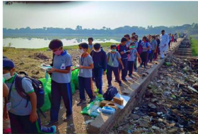
Actively participating in the betterment of society through the "Swachh Bharat" initiative

"School is practice for the future life."