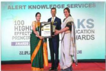
Principal,TKS – Highly Effective Principal award, 2017-18