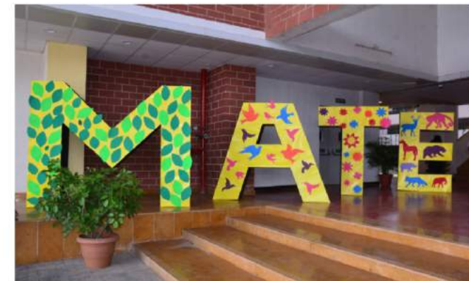
Mad About the Environment, the latest event in the Mad About Series focused on the importance of preserving the Environment