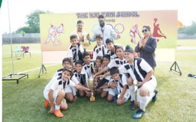
Promoting fitness and healthy competition through the "Khel Utsav" Inter-school Sports Tournament