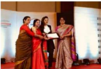
TheKalyaniSchool has been declared as the #BestEmergingSchool by bagging the 1st position in the East Zone, 2018.