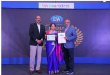
Ranked 3rd in Pune under Day – Boarding Co-ed school category by Education World