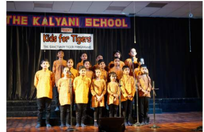
Inculcating the importance of protecting wildlife through the "Kids for Tigers" programme