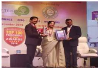
BrainFeed magazine awarded our school in the categories of Best CBSE Schools, Academic Excellence Schools, Sports Education, Community and Collaboration, and Parental Engagement.