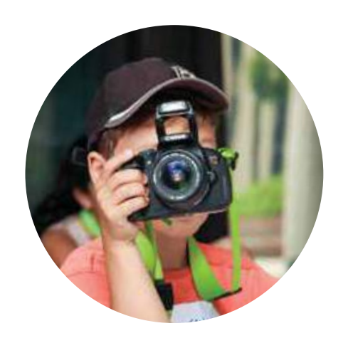
Film (Photography & Videography)

Introducing the wider forms of music, this programme caters to aspects of music like composition, performance and critical analysis.