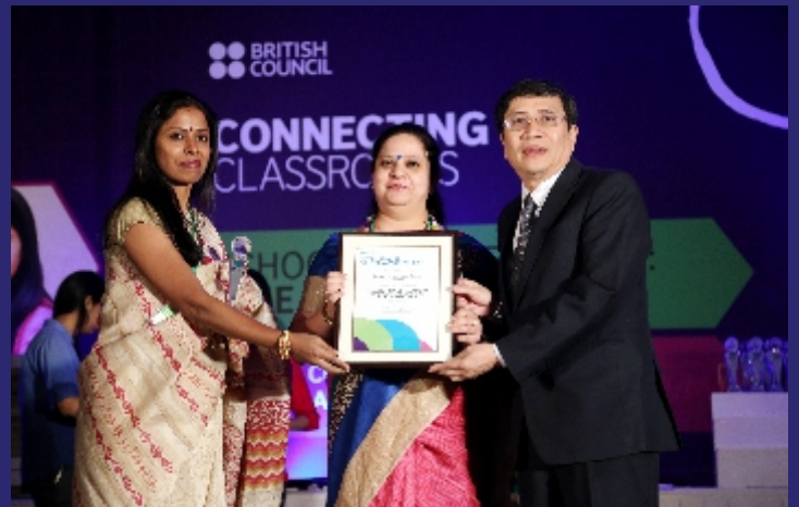
ISA - International School Award by British Council