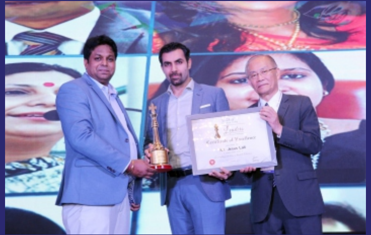
Education Leaders Award 2018 by Education Today