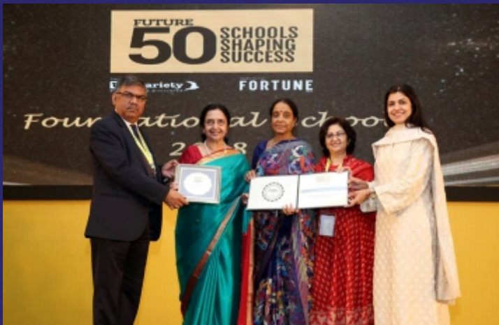
Future 50 Schools Shaping Success Award 2018