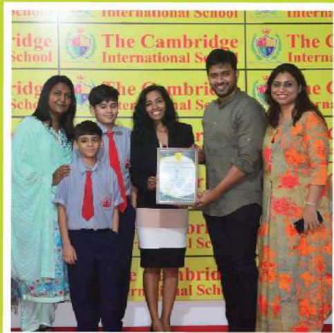
International Students Exchange programme with Apple International School, Dubai