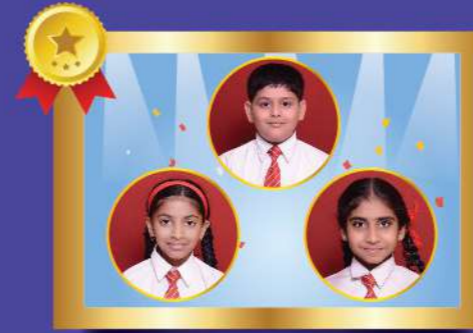
Primary Checkpoint Star Performers