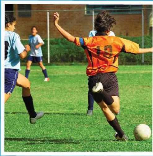
Outdoor (Sports Center)