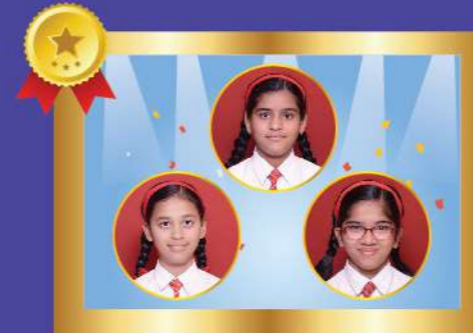
Secondary 1 Checkpoint Star Performers 2017-18