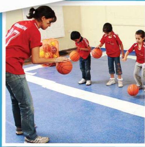
Indoor (Sports Center)

Let your child build a physique for a healthy wellbeing