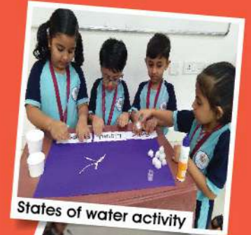
States of water activity