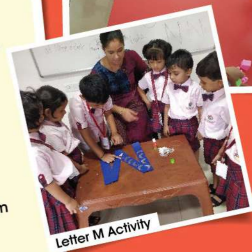
Letter M Activity