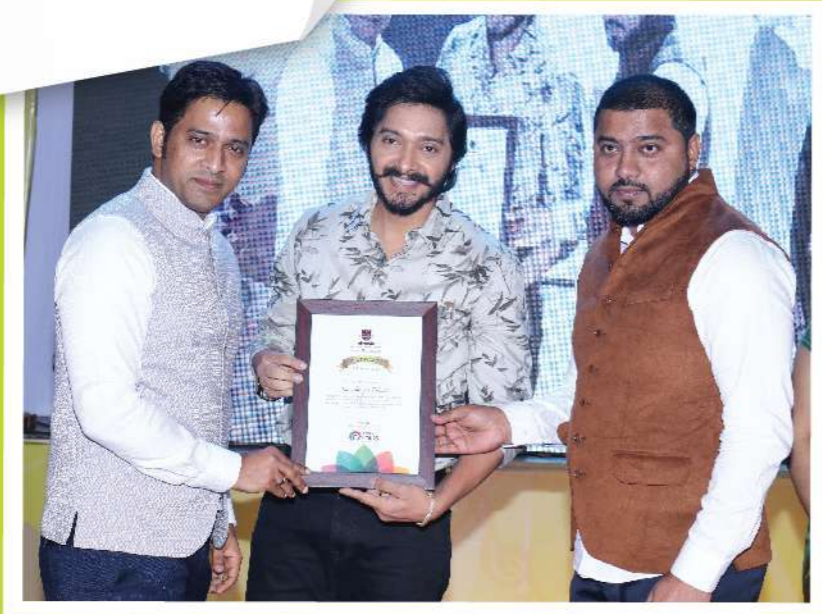
Celebrity Guest – Shreyas Talpade at our Annual Day Event

Let your child socialize for global excellence