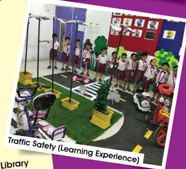
Traffic Safety (Learning Experience)