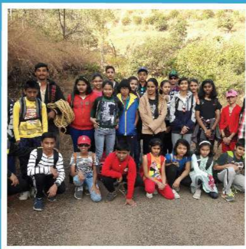
Panhgani (Field Trip)