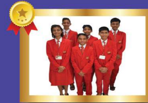
Secondary 1 Checkpoint Star Performers 2016-17