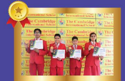
National Astronomy Challenge Gold Medalist