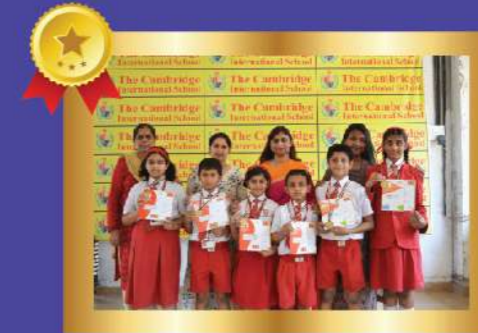
International English Olympiad Gold Medalist