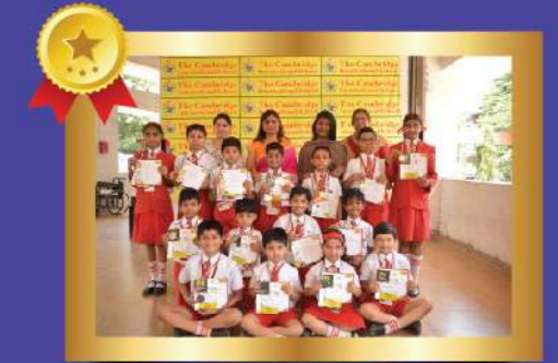
International Mathematics Olympiad Medalist