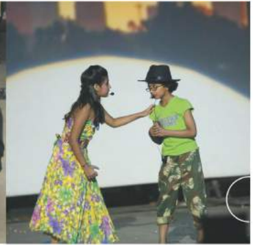
Creative & Performing Arts

Individual Mentor & Coach for each child – a continuous reinforcement of Self belief & Confidence.