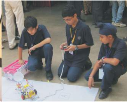
Reinforcing Concepts through Robotics