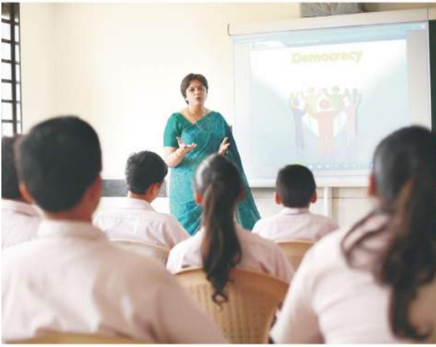
Interactive white board and projection screens