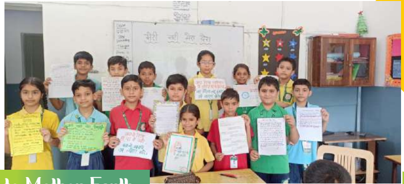
Dedication to Mother Earth