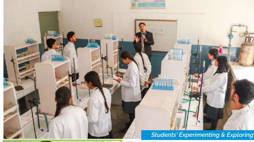
Students' Experimenting & Exploring