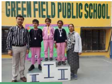
Experience the thrill of Victory & The Camaraderie of Sportsmanship